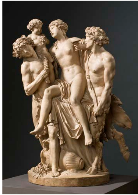
Bacchante Supported by Bacchus and a Faun , 1795 Claude Michel called Clodion French, 1738-1814 Terracotta 20 in. (50.8 cm) The Norton Simon Foundation