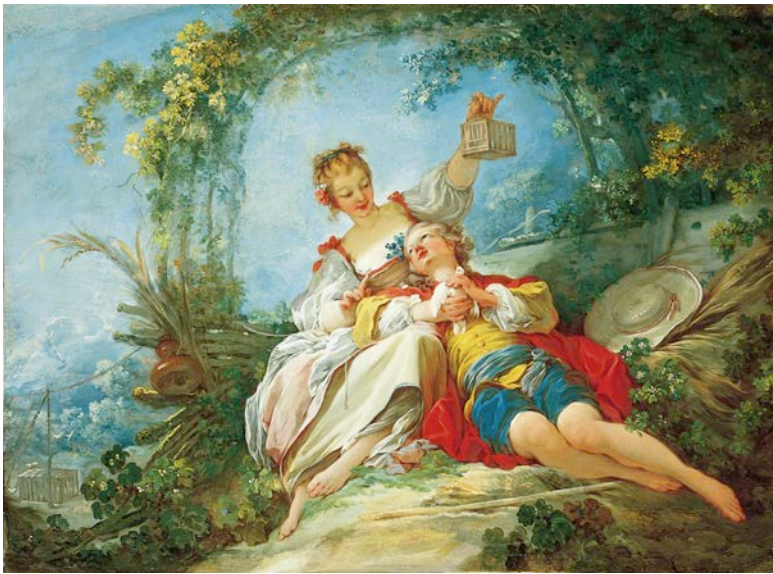
Happy Lovers , c. 1760-65 Jean-Honoré Fragonard French, 1732-1806 Oil on canvas 35-1/2 x 47-3/4 in. (90.2 x 121.3 cm) The Norton Simon Foundation