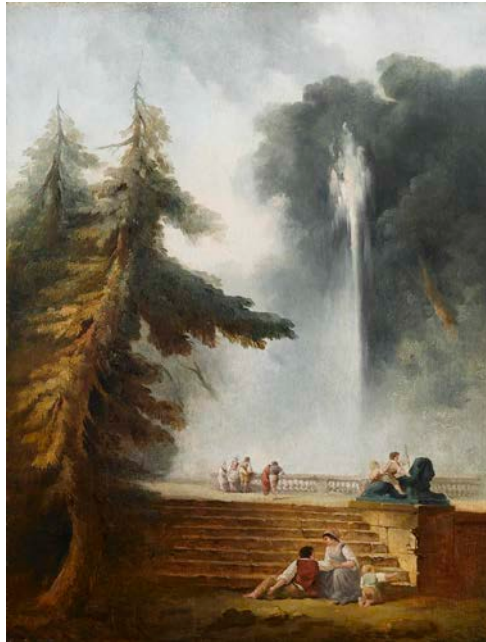
The Fountain , c. 1775 Hubert Robert French, 1733-1808 Oil on canvas 26 x 20 in. (66.0 x 50.8 cm) The Norton Simon Foundation