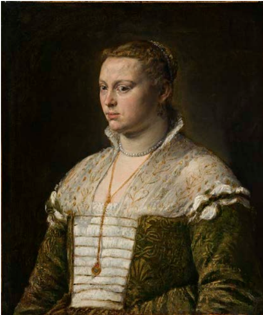
Portrait of a Lady , after 1570 Jacopo Bassano (Jacopo da Ponte), possibly Leandro Bassano Italian, 1510-1592 Oil on canvas 31 x 25-3/4 in. (78.7 x 65.4 cm) The Norton Simon Foundation

We are pleased to provide the following images for publicity relating to the exhibition. To receive digital versions of the images, please contact the Public Affairs department at (626) 844-6900 or media@nortonsimon.org .