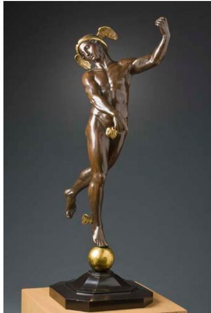
Flying Mercury , c. 1620 Northern Europe, 1610-1630 Bronze 27 in. (68.6 cm) The Norton Simon Foundation