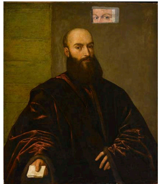
Venetian Nobleman , after 1530 Titian, or Imitator Italian, c. 1487/90-1576 Oil on canvas 42-1/2 x 36 in. (108.0 x 91.4 cm) The Norton Simon Foundation