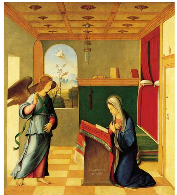
The Annunciation , c. 1500 Francesco Bissolo Italian, 1470/72-1554 Oil on panel, transferred to canvas 43-3/4 x 39-1/2 in. (111.1 x 100.3 cm) Norton Simon Art Foundation