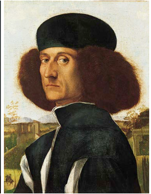
Portrait of a Venetian Nobleman , c. 1510 Attributed to Vittore Carpaccio Italian, 1455-1526 Oil on panel 14 x 10-3/4 in. (35.6 x 27.3 cm) The Norton Simon Foundation