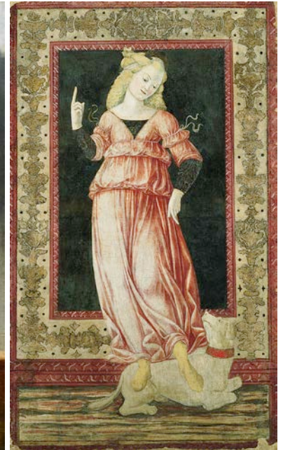
Fidelity , c. 1485 Francesco di Giorgio Martini Italian, 1439-1501/02 Fresco transferred to canvas, mounted on wood panel 49-1/2 x 29-3/4 in. (125.7 x 75.6 cm) The Norton Simon Foundation