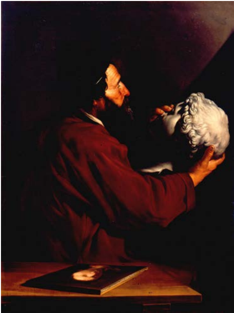
The Sense of Touch , c. 1615-16 Jusepe de Ribera Spanish, 1591-1652 Oil on canvas 45-5/8 x 34-3/4 in. (115.9 x 88.3 cm) The Norton Simon Foundation

We are pleased to provide the following images for publicity relating to the exhibition. To receive digital versions of the images, please contact the Public Affairs department at (626) 844-6900 or media@nortonsimon.org .