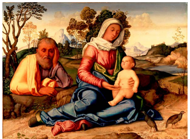
The Rest on the Flight into Egypt , after 1510 Vincenzo Catena Italian, c.1470-1531 Oil on panel overall: 32 x 43 in. (81.3 x 109.2 cm) Norton Simon Art Foundation