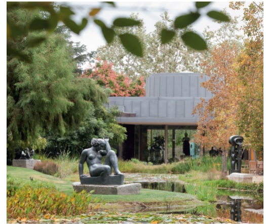
A Living Work of Art The Norton Simon Museum Sculpture Garden

books@nortonsimon.org ; or through ACC Distribution, New York.