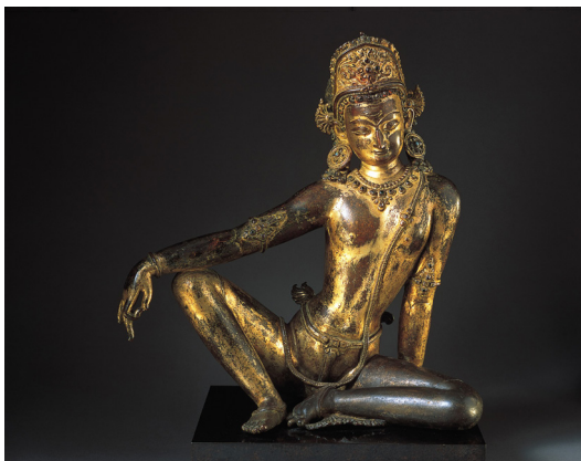
Asia: Nepal Indra , 13th century Gilt bronze 16 1/8 x 12 3/16 x 6 in. (41.0 x 31 x 15.2 cm) The Norton Simon Foundation