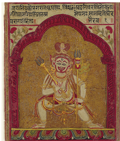
Asia: Nepal, Bagmati Province, Bhaktapur Ragamala Album: Bhairava Raga , c. 1625 Opaque watercolor and gold on paper 7 x 5 1/2 in. (17.8 x 14 cm) Norton Simon Art Foundation, Gift of Mr. Norton Simon