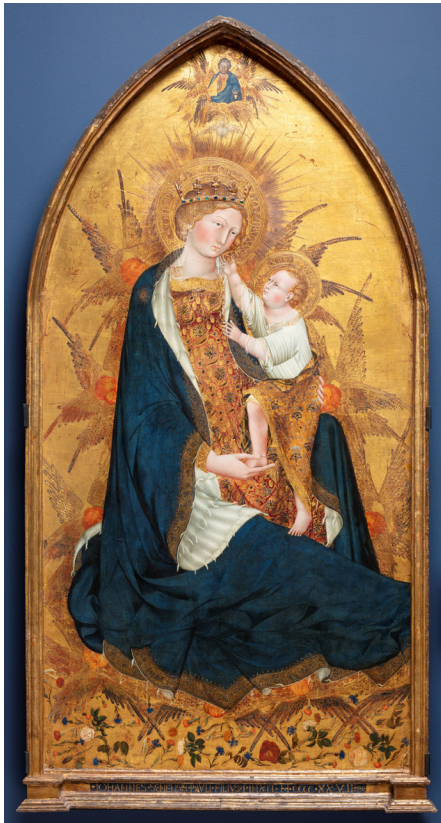
Giovanni di Paolo (Italian, 1403-1482) Branchini Madonna , 1427 Tempera and gold leaf on panel 72 x 39 in. (182.9 x 99.1 cm) The Norton Simon Foundation

The image(s) provided are exclusively for the press and may only be used for purposes of publicity for the exhibition. Any other use will require written permission from the Norton Simon Entities*. All images are the property of the Norton Simon Entities. All copyright and credits must appear on the same or facing page(s) as the image(s). Please refer below for proper notation of image caption(s) and credit(s).