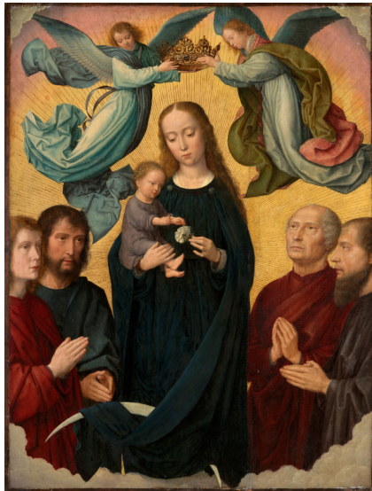
Gerard David (Netherlandish, c. 1460-1523) The Coronation of the Virgin, Maria in Sole , c. 1515 Oil on panel 28 x 21 1/2 in. (71.1 x 54.6 cm) The Norton Simon Foundation