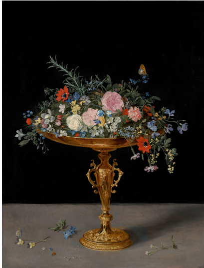
Jan Brueghel the Younger (Flemish, 1601-1678) Flowers in a Gilt Tazza , c. 1620 Oil on panel 21 3/4 x 16 3/4 in. (55.2 x 42.6 cm) The Norton Simon Foundation

At the Norton Simon Museum October 24, 2025 – February 16, 2026