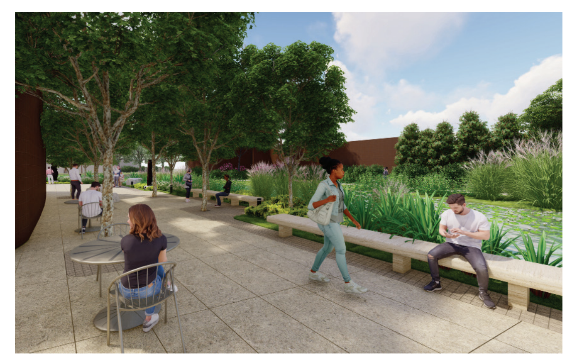
Rendering of the Norton Simon Museum's Sculpture Garden