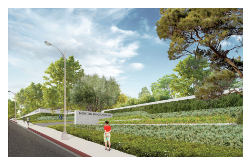
Rendering of the Norton Simon Museum's main entrance, courtesy of ARG and SWA