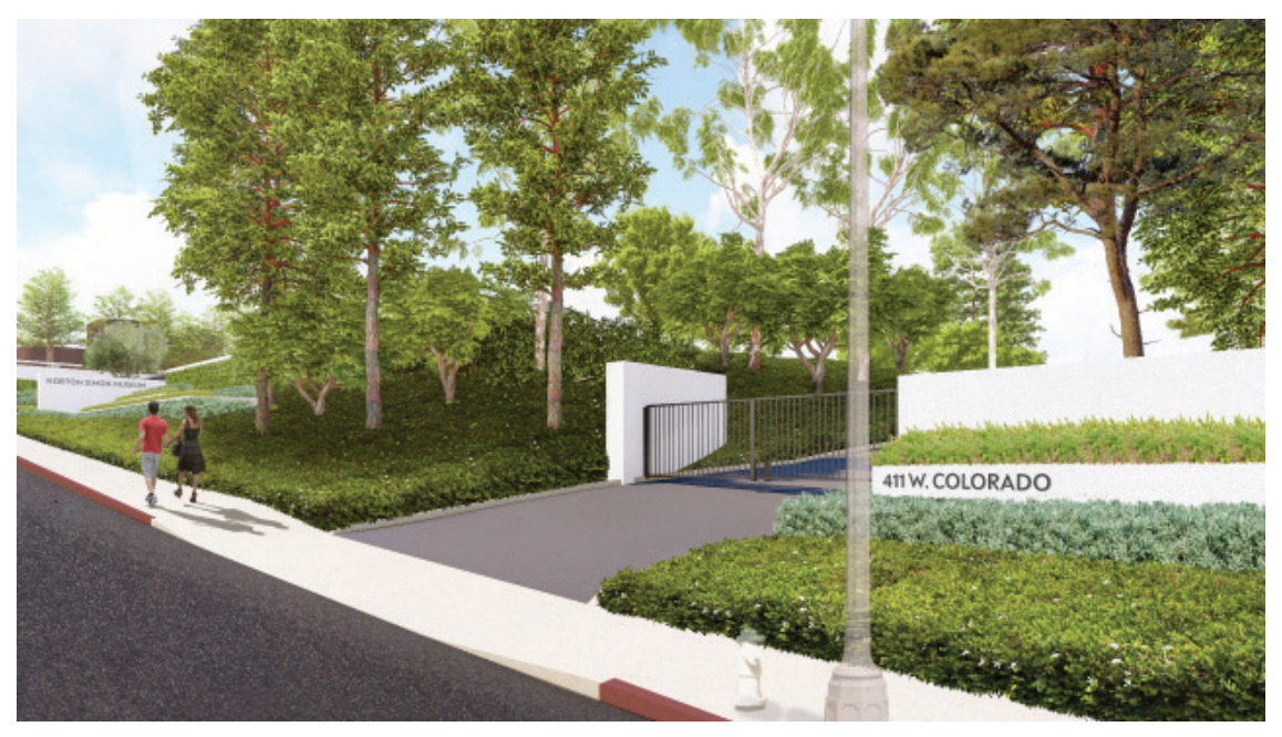
Rendering of the Norton Simon Museum's east driveway, courtesy of ARG and SWA

411 West Colorado Boulevard, Pasadena, California 91105 www.nortonsimon.org External Affairs Department 626.844.6900 media@nortonsimon.org