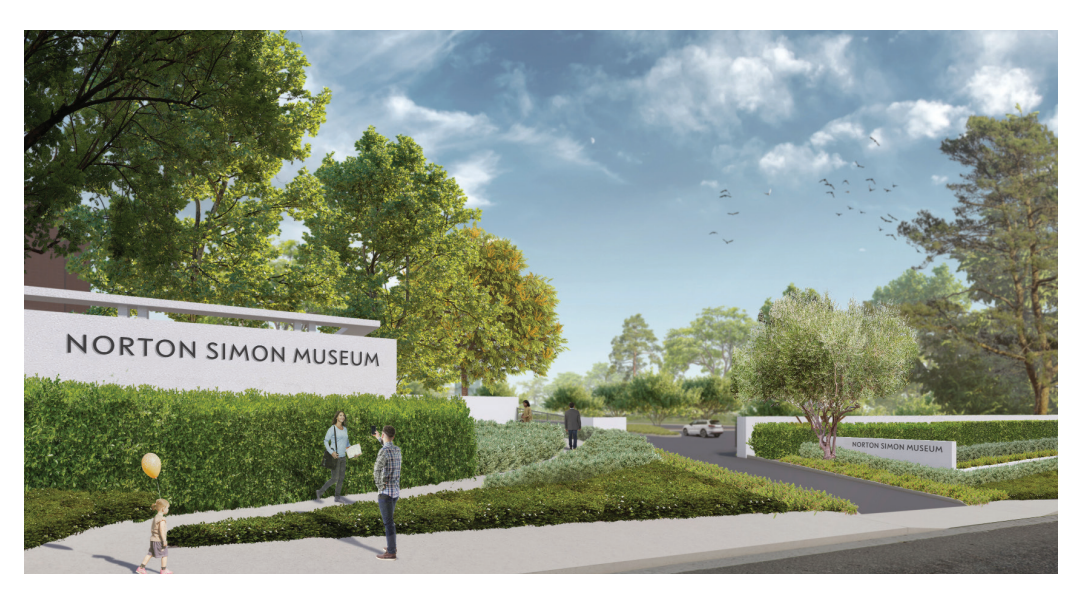
Rendering of the Norton Simon Museum's pedestrian walkway and main entrance, courtesy of ARG and SWA

The image(s) provided are exclusively for the press and may only be used for purposes of publicity for the exhibition. Any other use will require written permission from the Norton Simon Entities<sup>*</sup>. All images are the property of the Norton Simon Entities. All copyright and credits must appear on the same or facing page(s) as the image(s). Please refer below for proper notation of image caption(s) and credit(s).