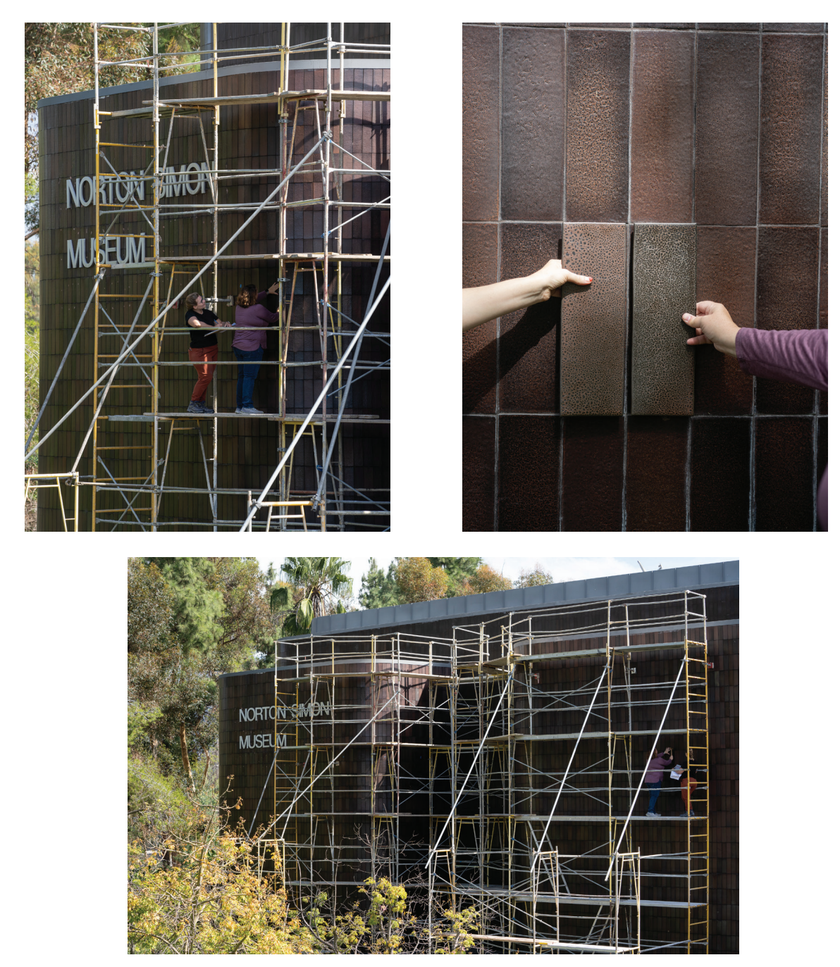
Top left and above: Conservation study of the Norton Simon Museum's tile, September 2023 Top right: Heath Ceramics and ARG staff comparing new tile with original tile on the Norton Simon Museum's facade, September 2023

411 West Colorado Boulevard, Pasadena, California 91105 www.nortonsimon.org External Affairs Department 626.844.6900 media@nortonsimon.org